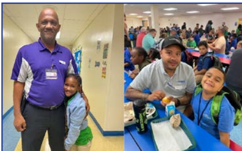
Dads Take Your Child to School Day Breakfast