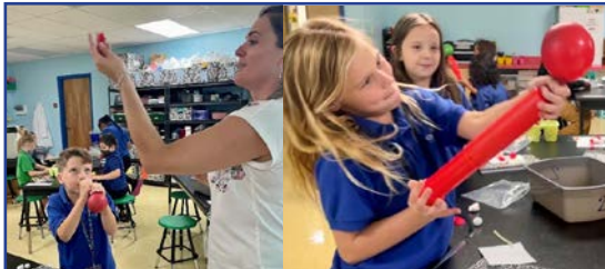
2nd Grade experimenting with air in the STEAM lab