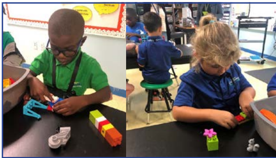
Kindergarteners completing hands on activities in the STEAM lab

1/1-1/4 – Winter Break 1/5 – Students Return 1/9 – SRO Appreciation Day 1/10 – Progress Monitoring 2 Assessment begins 1/12 – Report Cards issued