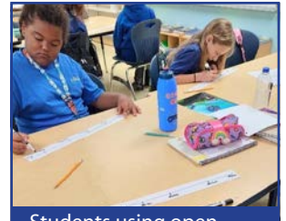
Students using open number lines