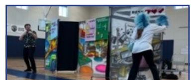
National Children's Theater production of Energy Endgame sponsored by Florida Power and Light