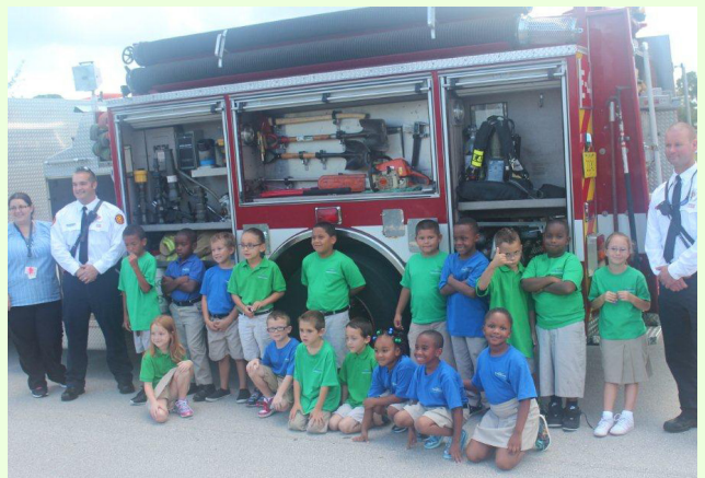
Patriot Day & National Day of Service and Remembrance