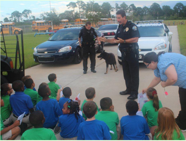
Patriot Day & National Day of Service and Remembrance

International Walk to School Day is a global event that involves communities from more than 40 countries walking and biking to school on the same day. It began in 1997 as a one-day event. Over time, this event has become part of a movement for year-round safe routes to school and a celebration. On Wednesday, October 9, Odyssey Preparatory Academy students and staff enjoyed a successful event on a beautiful morning. Students and staff enthusiastically participated by walking the perimeter of our fields. Kindergarten through second grade walked approximately 700 meters, while 3rd-5th grade walked about 900 meters. Thank you to all our participants!