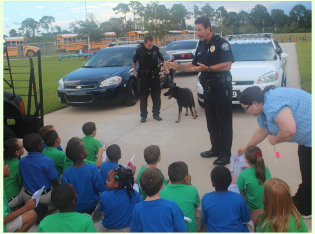
Patriot Day & National Day of Service and Remembrance

International Walk to School Day is a global event that involves communities from more than 40 countries walking and biking to school on the same day. It began in 1997 as a one-day event. Over time, this event has become part of a movement for year-round safe routes to school and a celebration. On Wednesday, October 9, Odyssey Preparatory Academy students and staff enjoyed a successful event on a beautiful morning. Students and staff enthusiastically participated by walking the perimeter of our fields. Kindergarten through second grade walked approximately 700 meters, while 3rd-5th grade walked about 900 meters. Thank you to all our participants!