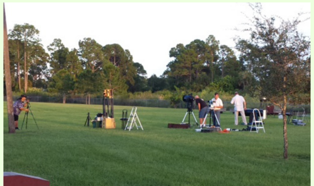
Brevard Astronomical Society (BAS) Star Party