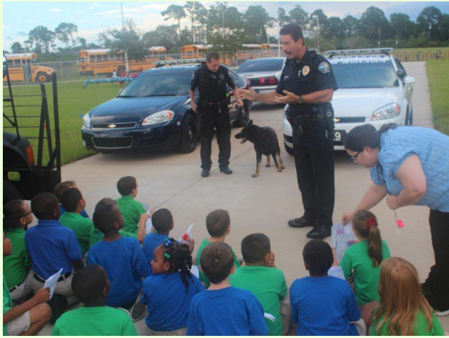
Patriot Day & National Day of Service and Remembrance

International Walk to School Day is a global event that involves communities from more than 40 countries walking and biking to school on the same day. It began in 1997 as a one-day event. Over time, this event has become part of a movement for year-round safe routes to school and a celebration. On Wednesday, October 9, Odyssey Preparatory Academy students and staff enjoyed a successful event on a beautiful morning. Students and staff enthusiastically participated by walking the perimeter of our fields. Kindergarten through second grade walked approximately 700 meters, while 3rd-5th grade walked about 900 meters. Thank you to all our participants!