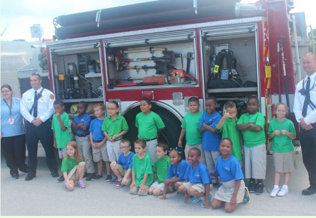
Patriot Day & National Day of Service and Remembrance