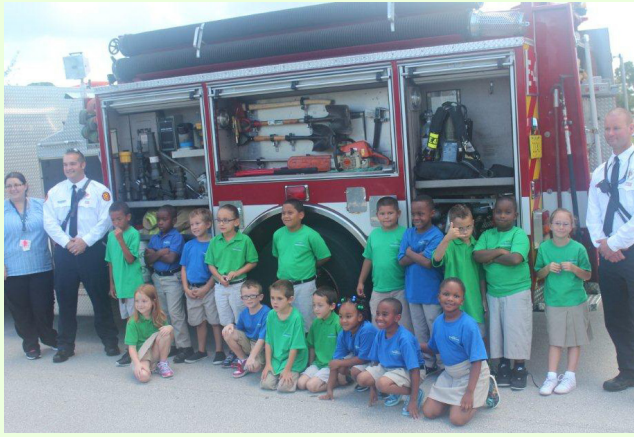
Patriot Day & National Day of Service and Remembrance